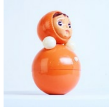
Moscow Design Museum