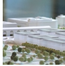
The Australian Centre for the Moving Image